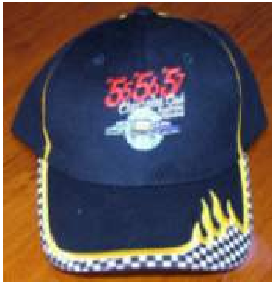
Club Cap $20.00