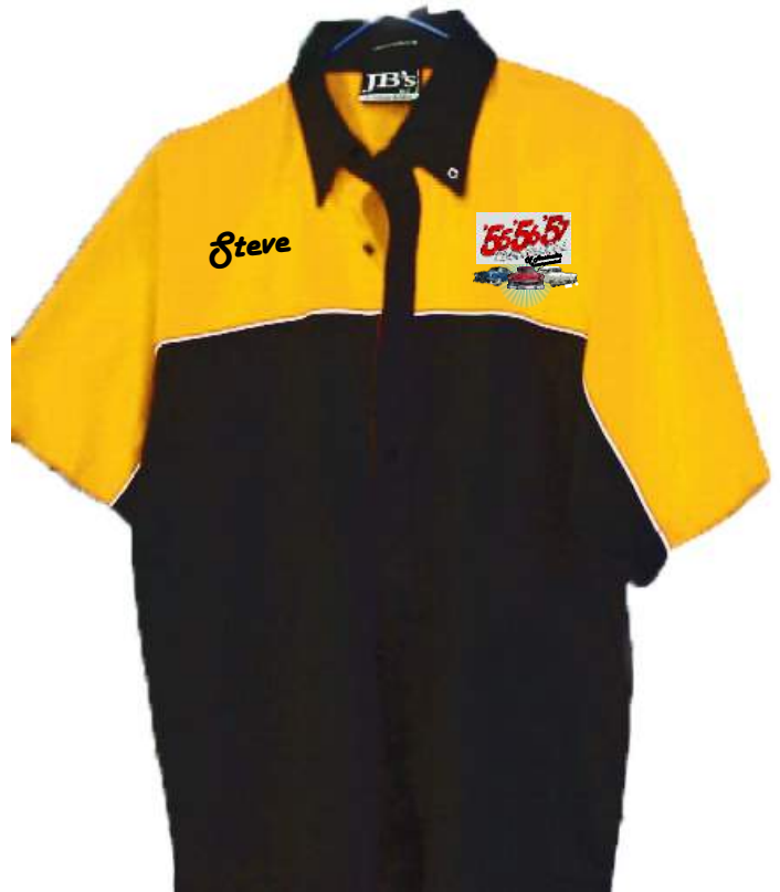
Bowling style shirts Mens Shirt $45.00